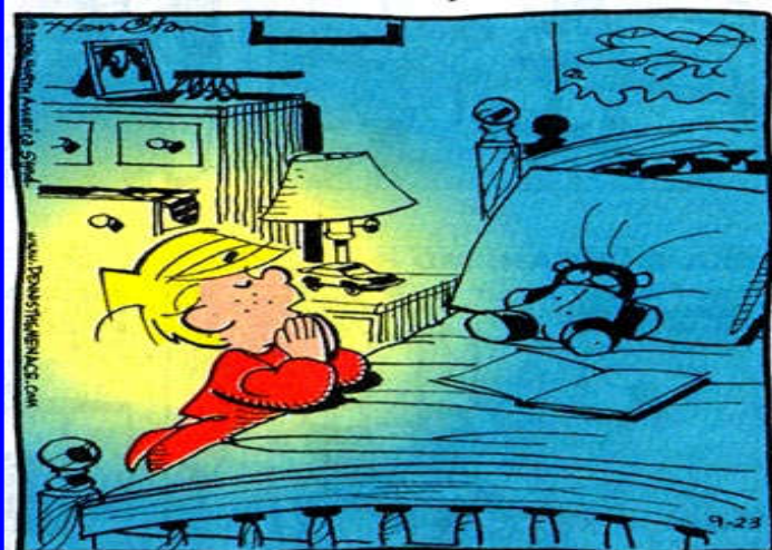
"YOU'LL BE GLAD TO KNOW I ONLY BROKE THREE-ANA-HALF COMMANDMENTS TODAY."